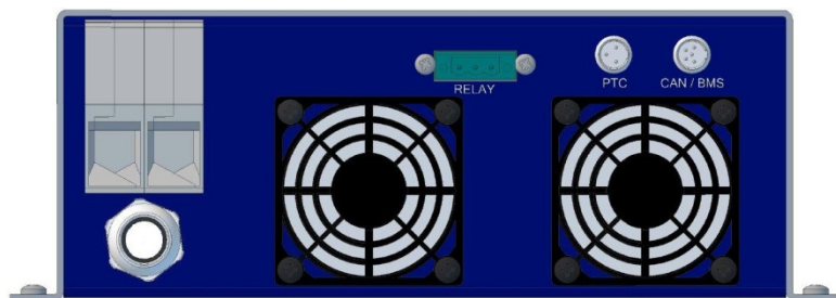
Positions of Connectors

The charger will be delivered with 2 m long battery wires (25 mm 2 for the 24V version and 16 mm 2 for the 48V Version). Other lengths/versions on request.